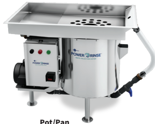
Pot/Pan Model PRP