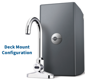
Deck Mount Configuration

The Instant Warm Handwash System provides commercial kitchens with a sanitary, touchless handwashing solution that promotes hygiene by providing instant warm water in locations where employees need to wash their hands consistently and effectively.