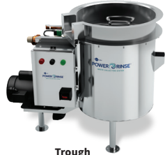
Trough Model PRT