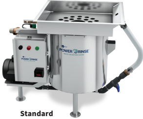
Standard Model PRS